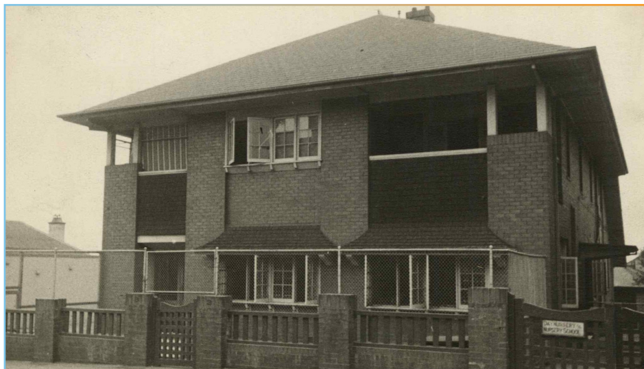
Below: The Newtown and District Day Nursery building, shortly after opening in 1930.

It was in very good condition with a large garden play area, and needed few alterations to make it a Day Nursery.