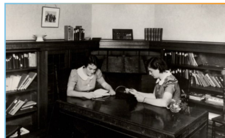
Above: Students at the Nursery School Training College at 3 Linthorpe Street, c. 1940s.