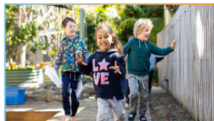
Above: Children at SDN Linthorpe St, 2018

The changes in the sector to increase the quality of early childhood education and care have confirmed our own approach to professional skilled staff and services since our beginnings.