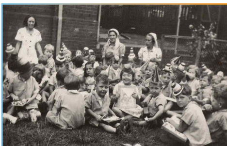
Above: Outdoor party at Newtown Day Nursery and Nursery School, c. 1944.

The original interior design featured the colour blue — blue chairs, tables and white cots with blue bed covers. The children were even dressed in blue overalls. In the blue bathrooms were low basins, and individual pegs held blue and white towels, encouraging